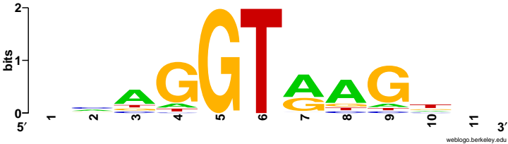
(a) Donor splicing motif consensus